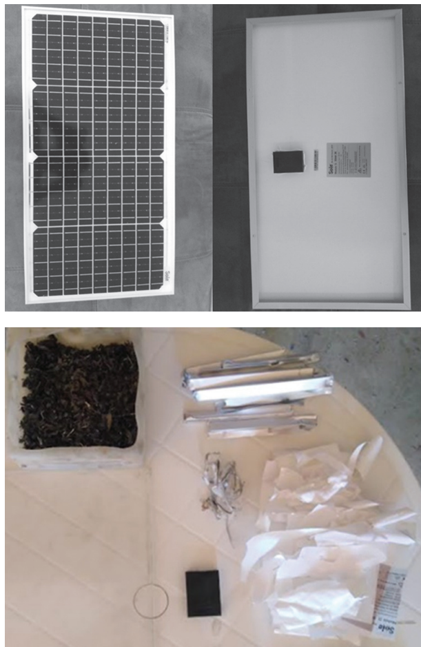
Fig. 1. PV panel MODULE SL30 AA under study, before (top) and after (bottom) a manual mechanical separation

The photovoltaic panel from the study is model MODULE SL30 AA, manufactured by SOLE. Figure 1 (top) shows the studied panel before mechanical treatments, and Fig. 1 (bottom) shows the panel disassembled using pliers, screwdriver, scalpel, spatula, and blow-dryer. The steps done in manual mechanical separation of the panel into elements are listed in Table 1, as well as the time duration of each step. The next process in recycling would be a chemical separation of metal from the anti-reflective (AR), P , and N layers, but it was omitted in this paper.