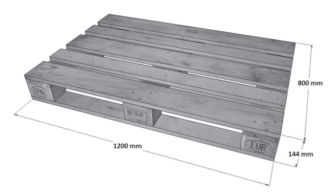
Fig. 3. The EUR-pallet